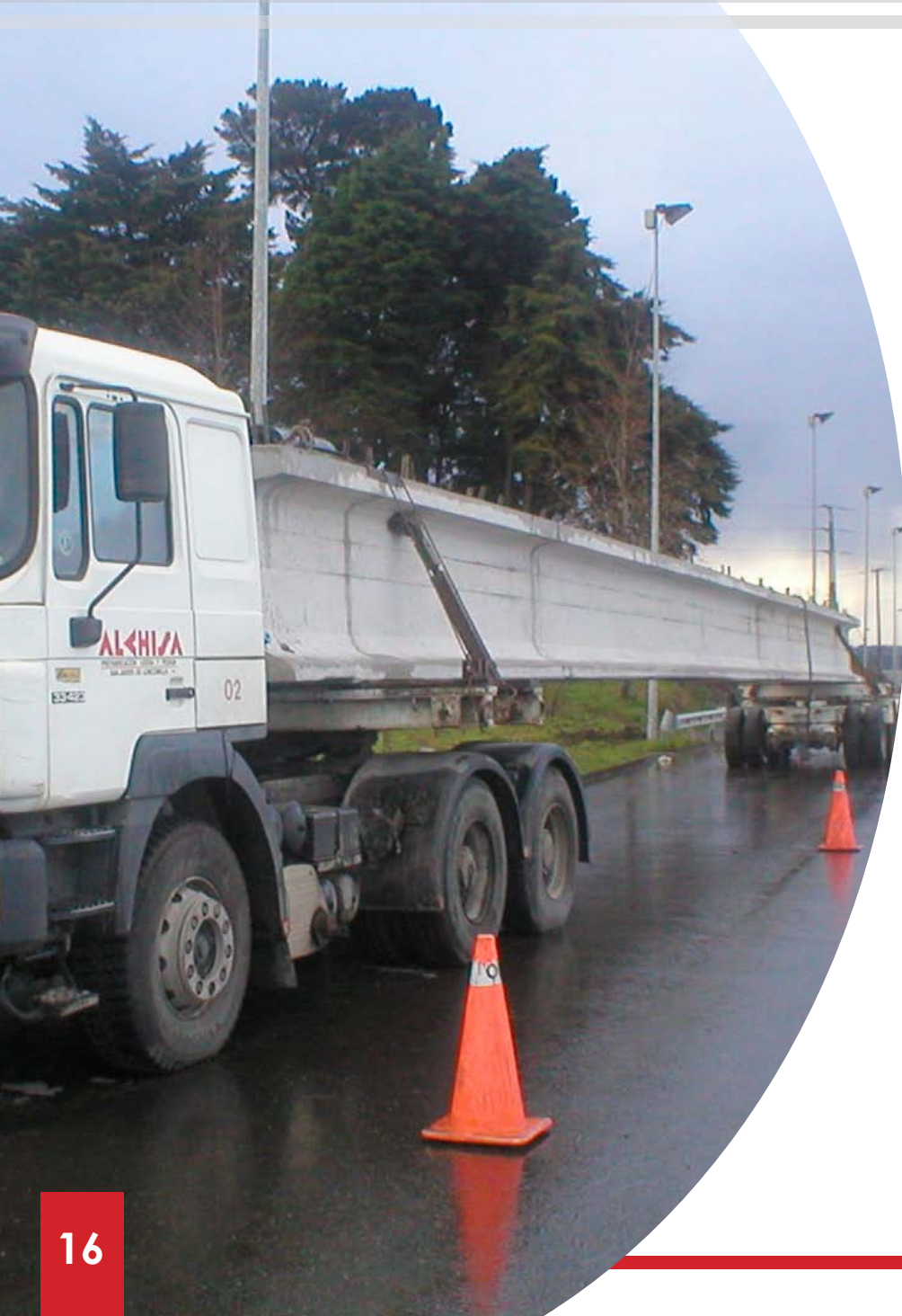
a.- VIGAS N